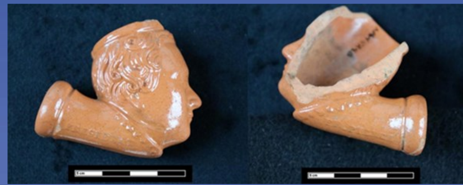
Figure A. The right side of the pipe reads "PRESIDENT," the left side "FR."

During his time as President, the country saw national tensions only rise as the Kansas-Nebraska Act of 1854 led to heightened tension between the North and South. This act allowed states to determine whether they were a free state or a slave state. Kansas